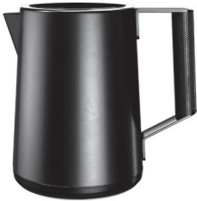
Tea Maker Body