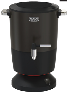
Electric Samovar Body