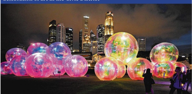
The Padang is host to Ephemeral (above), an immersive light and sound installation which uses inflatable spheres to mimic bubbles, by Sydney-based design studio Atelier Situ. Aimed at capturing ephemerality in visual form and evoking a sense of childlike wonder, it is among newly commissioned works by local and international artists featured in the Light to Night festival, which is themed "Here and Now" this year. There will also be over 60 programmes aimed at fostering a greater appreciation for art during the festival, which runs from Jan 6 to 26 in the Civic District. Admission is free.

Celebration of art in the Civic District