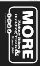
Trails by MORE - Maryland, DC, and Virginia