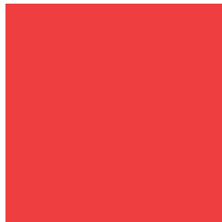
6057 FF FL Red