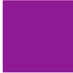
1038 FF FL Violet