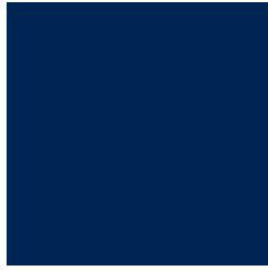
2441 Blue #1