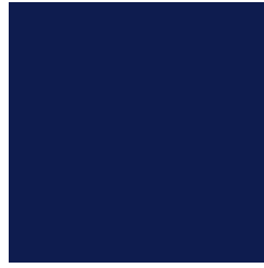
2442 Blue #2