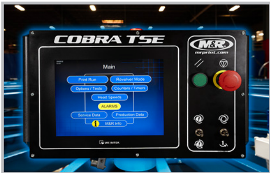
User-friendly touchscreen interface provides ease of use