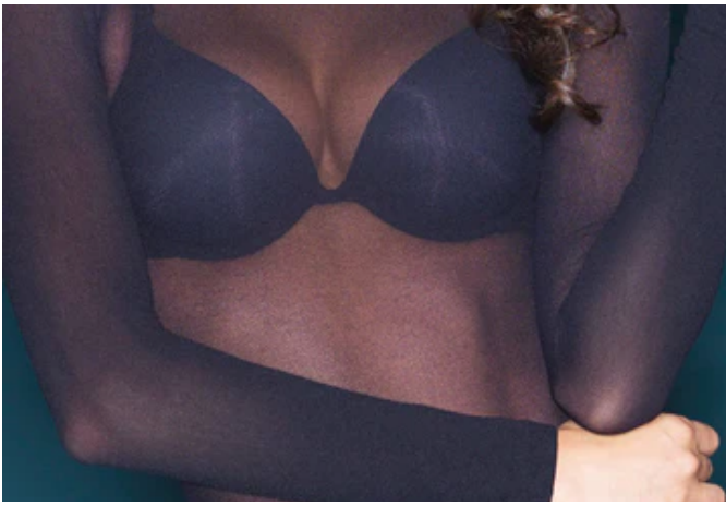
See Through Shirt - [Second Skin] $24.95 USD