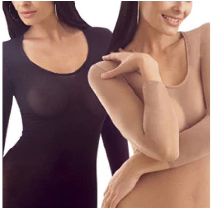
2 Plus Size See Through Longsleeve Shirts $39.95 USD