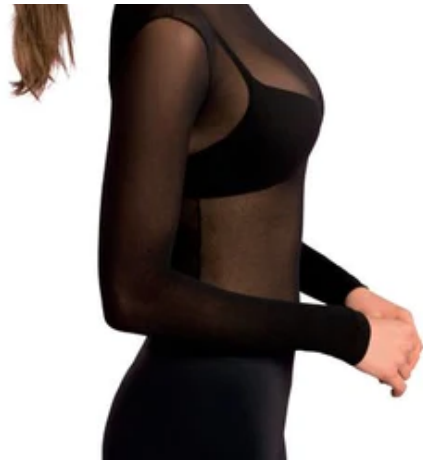
See Through Shirt $24.95 USD