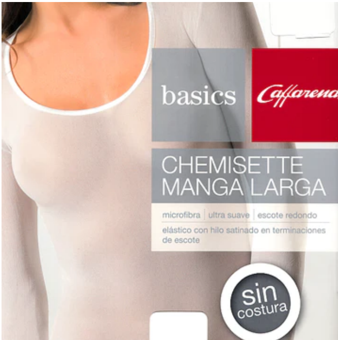
See Through Pantyhose Shirt - Nylon $24.95 USD