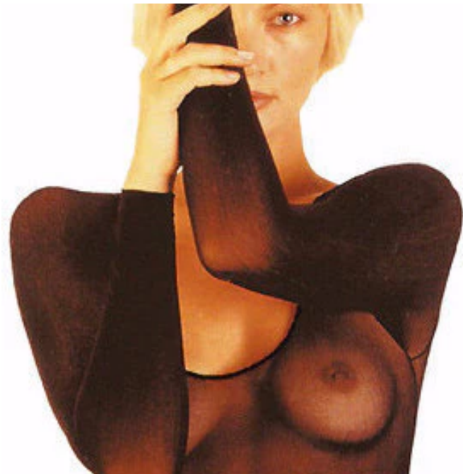
Sheer Shirt $24.95 USD