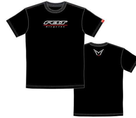
Felt Black Corp T-Shirt