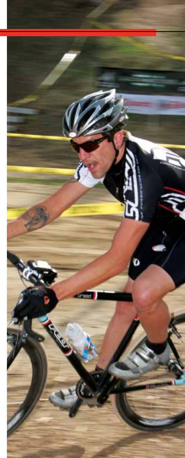
The Cyclocross Series