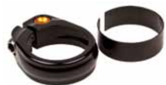
Felt Standard Seatpost Clamp