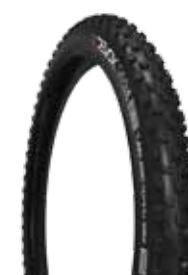
Devox MTB TAR Tire 26x2.1