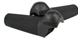
Felt Tri Tip TT/TRI Bar Grips