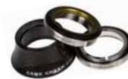
Cane Creek Carbon Headset 1-1/8"