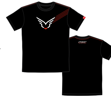
Felt Black F-Wing T-Shirt