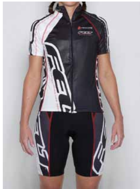
Felt Team Shorts - Women's