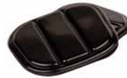
Felt TT/TRI Aero Bar Gel Replacement Pads