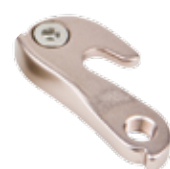
Felt MTB/Café/X:City Derailleur Hanger