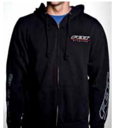
Felt Corporate Zip Sweatshirt