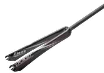
Felt 3.2 Carbon Aero Road Fork