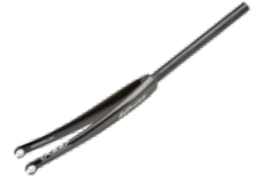
Felt 1.2 Carbon Road Fork