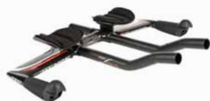
Felt Bayonet TT/TRI Bar Carbon/Alloy