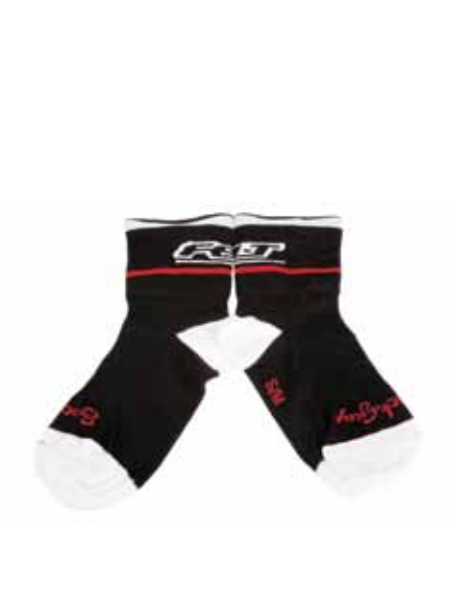
Felt Corp Socks