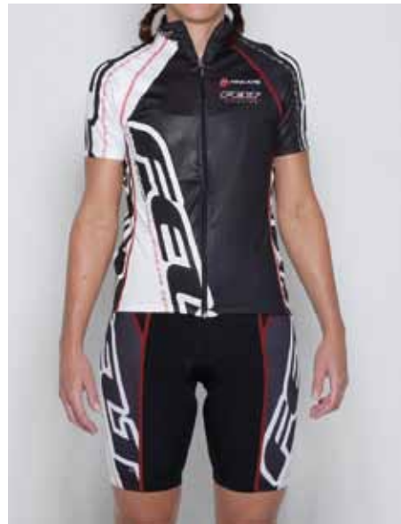
Felt Team Short Sleeve Jersey - Women's