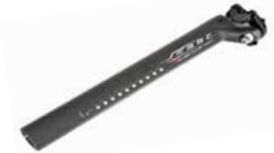
Felt 3.1 Carbon Aero Seatpost Rearward Offset