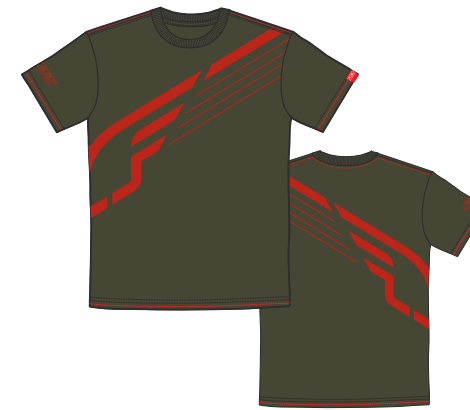
Felt Olive Big F T-Shirt