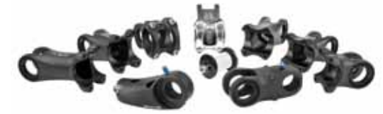
Bayonet 2 Stem Extension