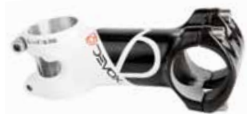
Devox Alloy Road Stem