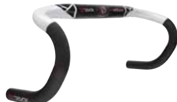
Devox Carbon Road Handlebar