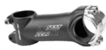
Felt 1.1 Alloy Stem