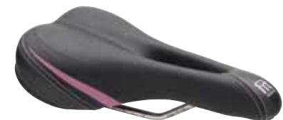
Felt Fit Woman Saddle