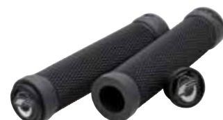
Felt MTB Dual Density Grips