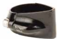
Felt TT/TRI Aero Seatpost Clamp 2009+