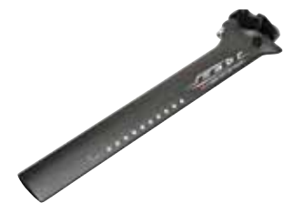
Felt 1.1 Carbon Aero Seatpost Standard Offset