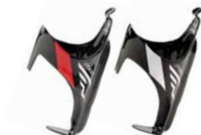
Felt Carbon Bottle Cage