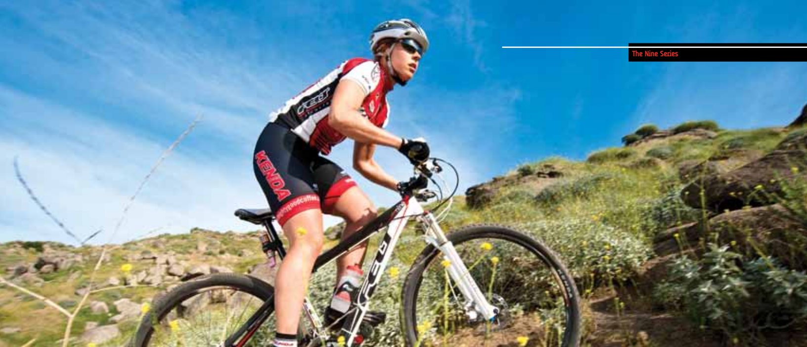
The Nine Series