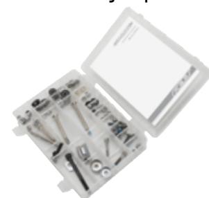
Felt MTB Equilink Suspension Kit