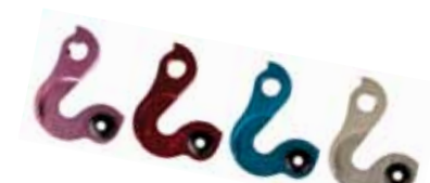
Felt Road Derailleur Hangers