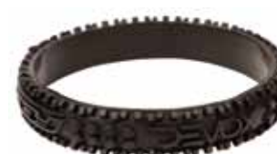
Felt Silicone Tire Tread Bracelet