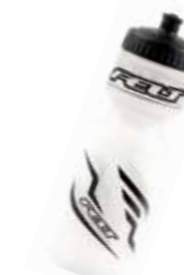
Felt Water Bottle