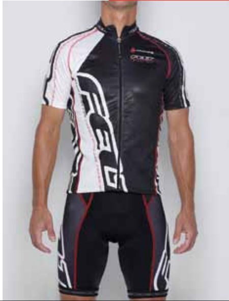
Felt Team Short Sleeve Jersey - Men's