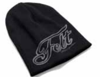
Beanie Cruiser Logo