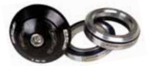
FSA Headset 1" TT/TRI