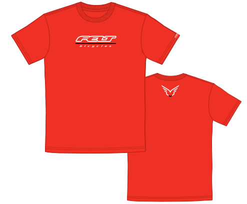
Felt Red Corp T-Shirt