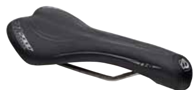
Felt 3.1 TT/TRI Saddle