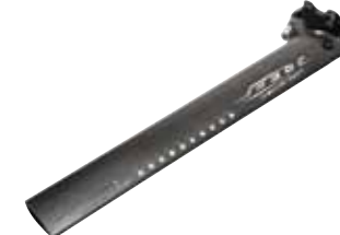
Felt 3.1 Carbon Aero Seatpost Standard Offset