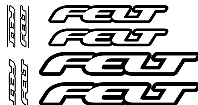
Felt 8 Piece Decal Set