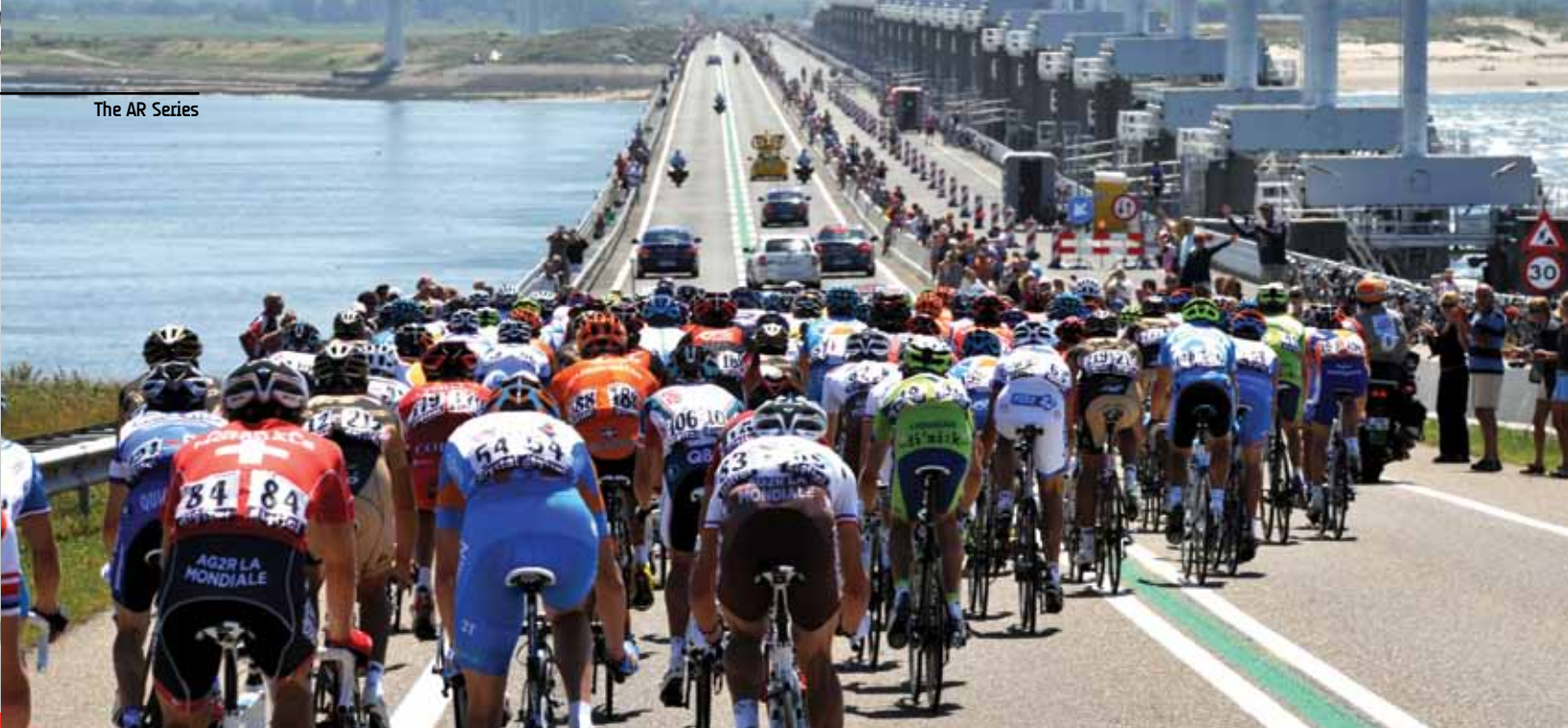
The AR Series