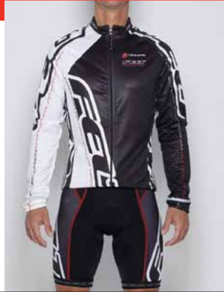
Felt Team Long Sleeve Jersey - Men's