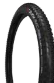
Devox MTB RXC Tire 26x2.0