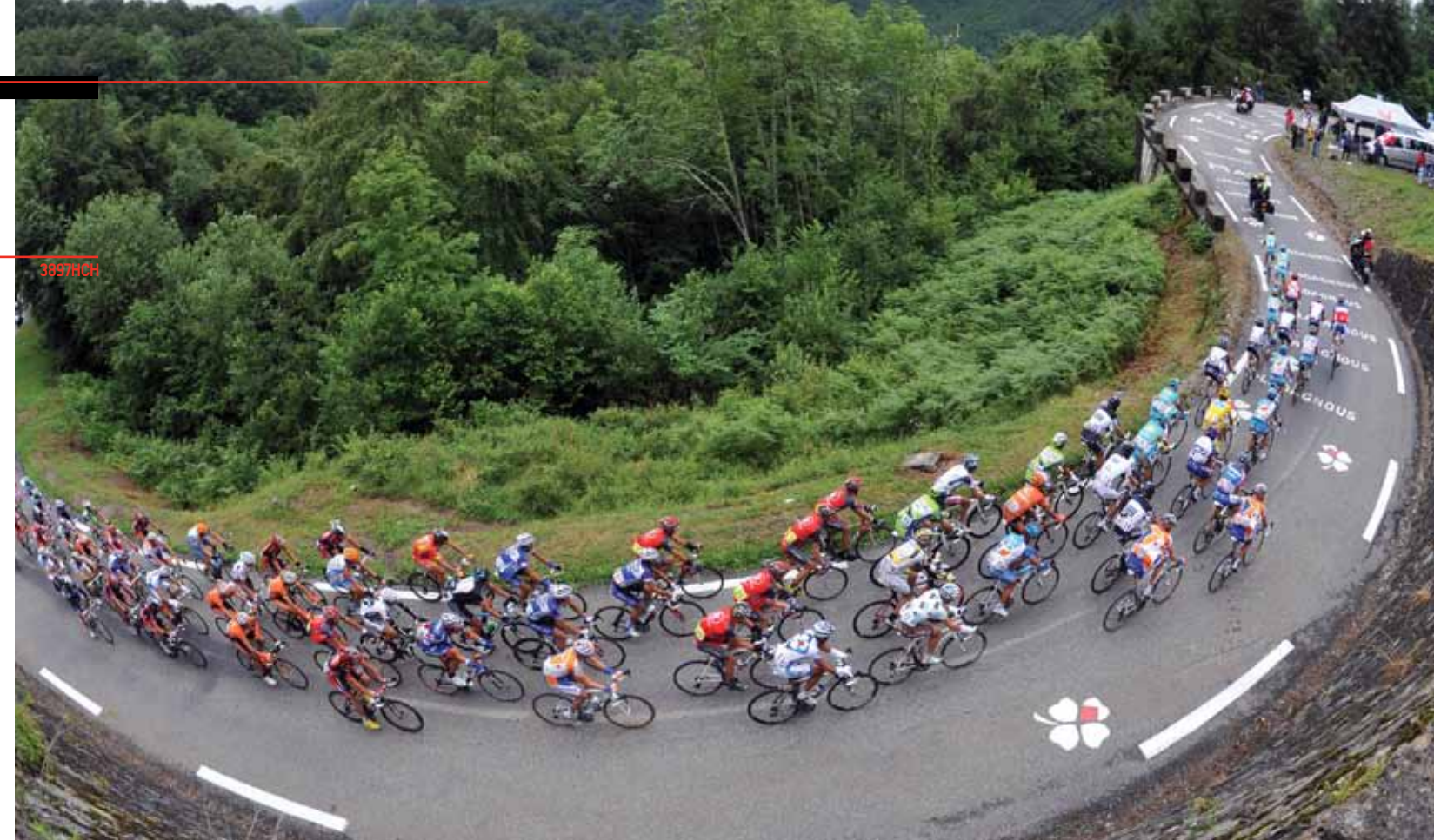
The F Series

Get more acquainted with the podium this year. Get an F Series bike.