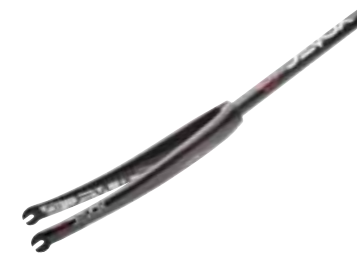
Devox Road Fork