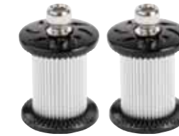
Bayonet 2 Stem Spline Shaft Assembly