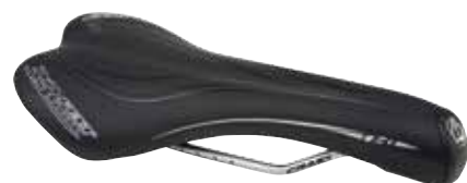
Felt 3.3 TT/TRI Saddle