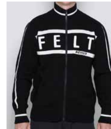
Felt Wool "Throwback" Sweater