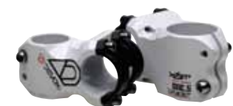
Devox MTB XAM Alloy Stem