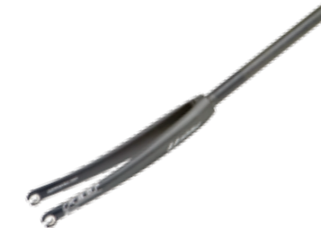
Felt 1.1 Carbon Road Fork