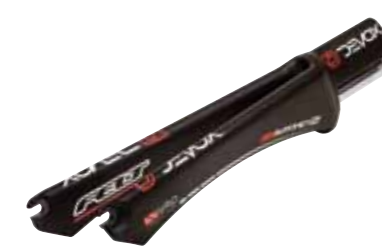
Devox Bayonet 2 Steering System