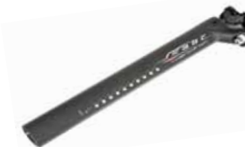
Felt 1.1 Carbon Aero Seatpost Rearward Offset