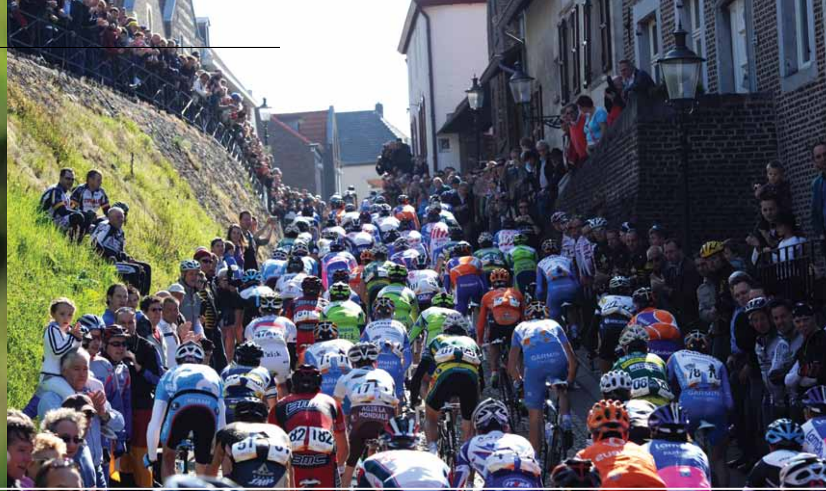
The F Series