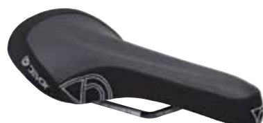
Felt MTB XAM Saddle