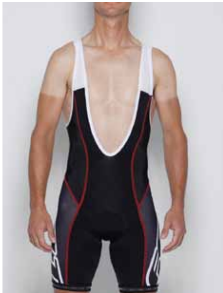
Felt Team Bib Shorts - Men's