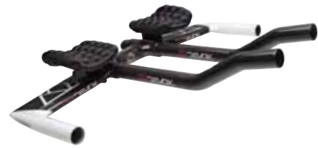
Devox Carbon TT/TRI Bar