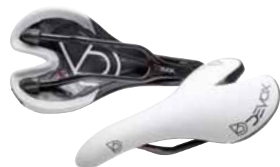
Devox Carbon Road Saddle