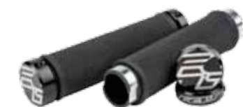
Devox MTB Lock-On Grips