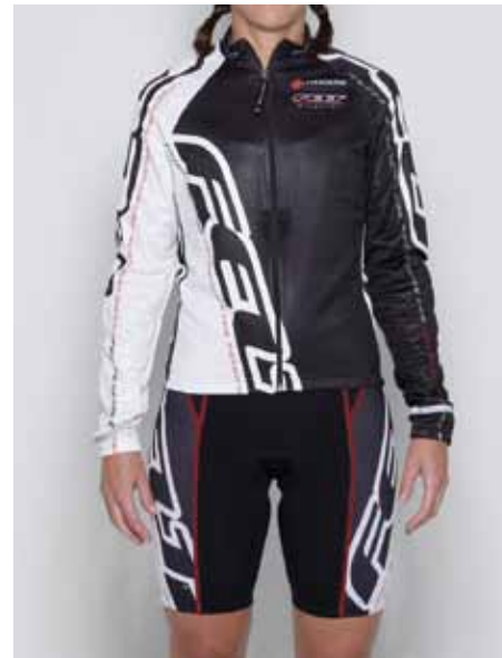
Felt Team Long Sleeve Jersey - Women's