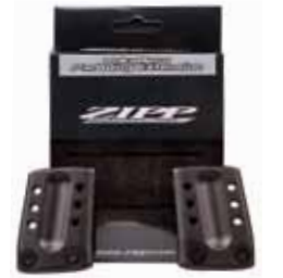
Zipp Aero Bar Pad Extensions For Bayonet Bars