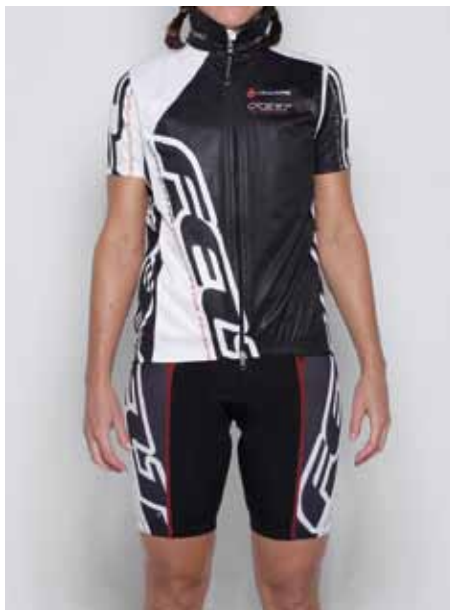
Felt Team Vest - Women's