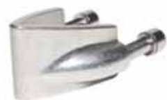
Felt TT/TRI Aero Seatpost Clamp 2008