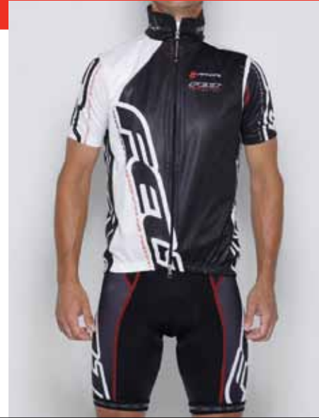
Felt Team Vest - Men's