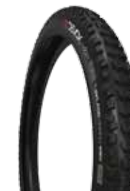
Devox MTB XAM Tire 26x2.3