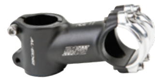
Felt 2.1 Alloy Adjustable Stem