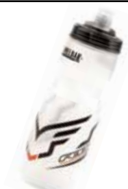
Podium Water Bottle By CamelBak