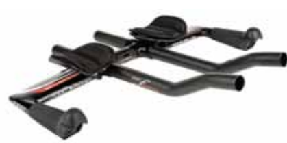
Felt Bayonet TT/TRI Bar Alloy