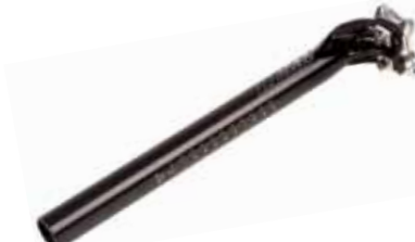
Felt 1.1 Carbon Seatpost