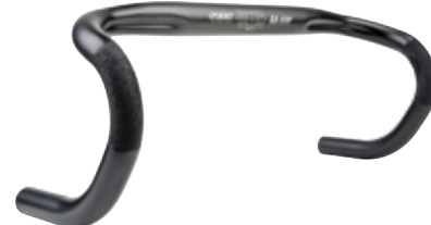
Felt 1.1 Carbon Road Handlebar