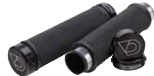
Felt MTB Lock-On Grips