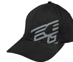
Felt Flex-Fit Corp Hat