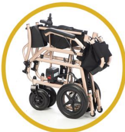
Easy to Fold