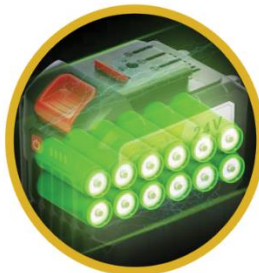
Lithium Ion Battery