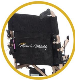
Lots of Storage