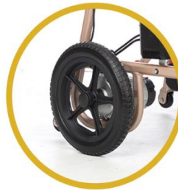
Never a Flat Tire