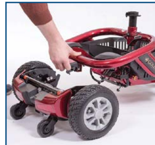
Disassembles easily for transport!