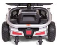
SATIN SILVER Limited Edition