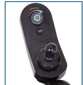
Ergonomic LiNX controller