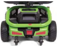
ENVY GREEN Limited Edition