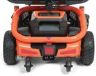
SOLAR FLARE ORANGE Limited Edition