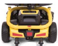
SUNBURST YELLOW Limited Edition