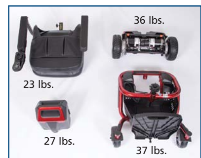
Perfect for transport!

Some accessories require a mounting bracket or mounting clips.