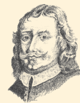
JOHN BUNYAN 54