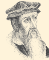
JOHN CALVIN 38