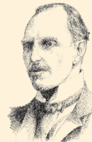
C. T. STUDD 150