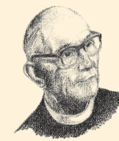
MARTIN NIEMOLLER 160