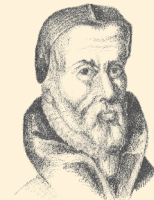
WILLIAM TYNDALE 32