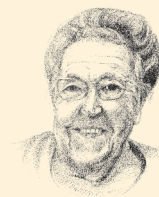
CORRIE TEN BOOM 156