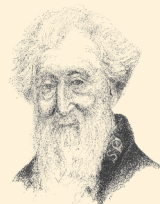
WILLIAM BOOTH 112