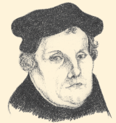
MARTIN LUTHER 22