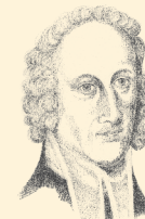
JONATHAN EDWARDS 60