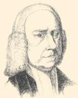
GEORGE WHITEFIELD 74