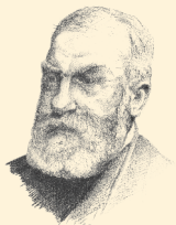
D. L. MOODY 132