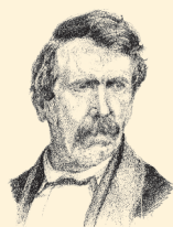
DAVID LIVINGSTONE 100