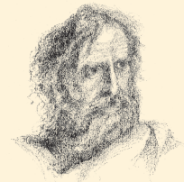
PAUL THE APOSTLE 8

10Publishing, a division of 10ofthose.com Unit C, Tomlinson Road, Leyland, PR25 2DY, England Email: info@10ofthose.com Website: www.10ofthose.com