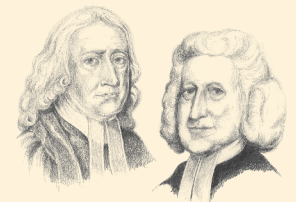
JOHN & CHARLES WESLEY 66