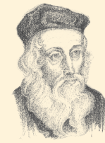
JOHN WYCLIFFE 16