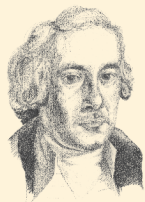
WILLIAM WILBERFORCE 80