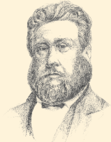
C. H. SPURGEON 126