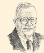
CHUCK COLSON 216