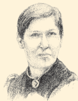
MARY SLESSOR 144