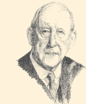
DR. MARTYN LLOYD-JONES 180