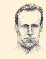
ERIC LIDDELL 192