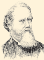
HUDSON TAYLOR 118