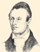
ADONIRAM JUDSON 94