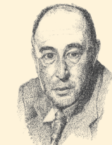
C. S. LEWIS 174