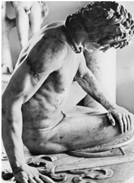
Plate 1 The Dying Gaul (also known as The Dying Gladiator ), Capitoline Museum, Rome. “Rome was cruel . . .”