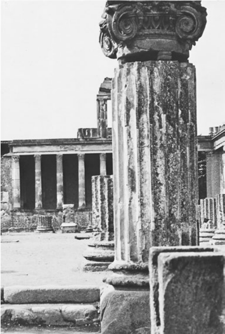
Plate 3 Ruins at Pompeii, Italy. “And Rome gradually became a ruin.”