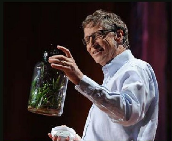
Bill Gates: Innovating to Zero - TED Talk

Customers in The USA, Canada, Iceland, Sweden, United Kingdom, Germany, Australia, Spain, South Africa, Singapore, Indonesia, South America, Mexico, India, among other countries.