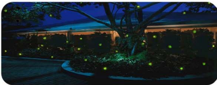
"Turning your yard or garden into a Magical wonderland for family, friends, and guests."

NOTE: For battery-operated use without solar charging, install 2 standard AA Alkaline batteries to operate the 'Fireflies' continuously, for approximately 4 weeks. If the On/Off switch is used to operate only when desired, batteries may need changing only once or twice per year.