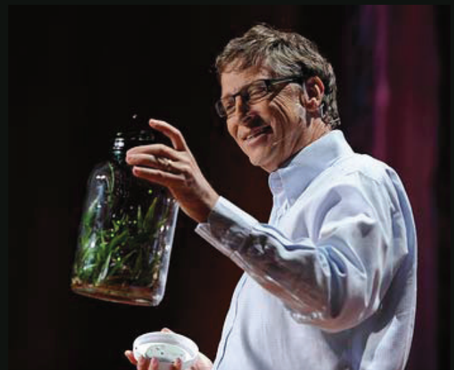
Bill Gates: Innovating to Zero - TED Talk

Customers in The USA, Canada, Iceland, Sweden, United Kingdom, Germany, Australia, Spain, South Africa, Singapore, Indonesia, South America, Mexico, India, among other countries.