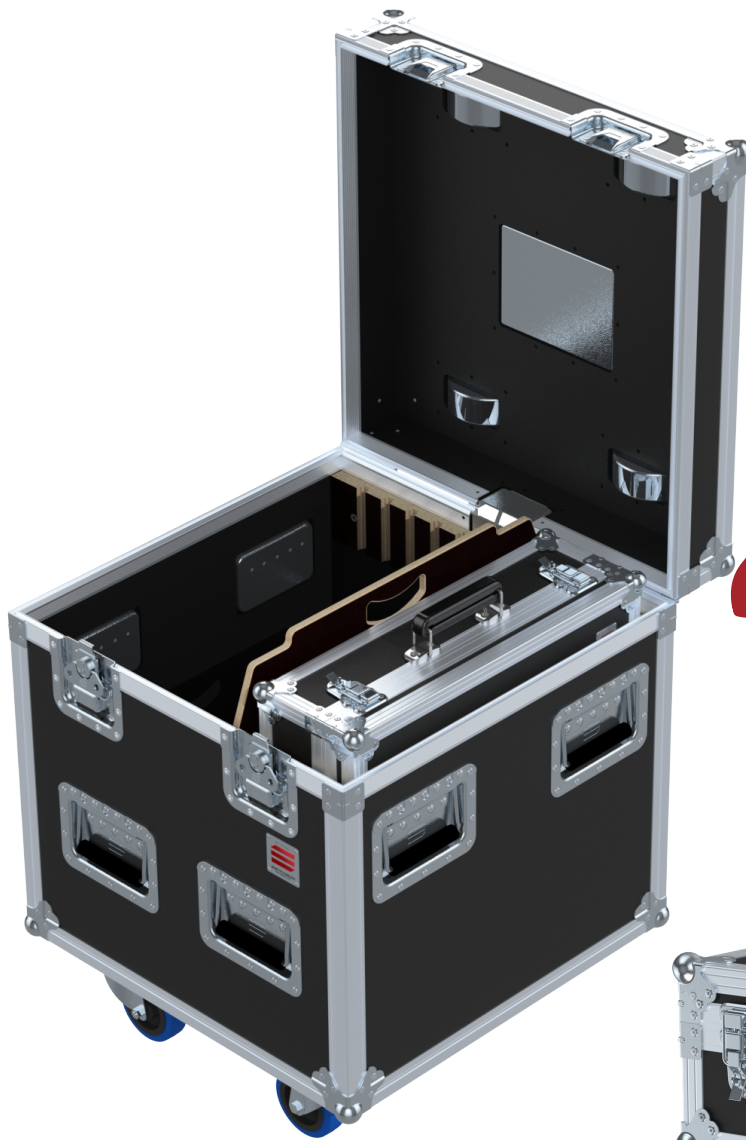
Hand case Ref. S1AA.0525218

The Tour trunks are also designed to carry briefcases, perfectly organized inside.