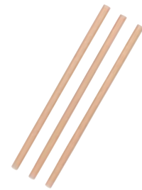
REGULAR STRAW UNWRAPPED

Item Code STHSC8S Length 200mm Diameter 8mm Qty 300/Box