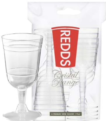
CRISTAL RANGE WINE CUPS

RC-CP425RD20 425ml 20/Pack | 240/Ctn 20 x Red 425ml Cups & 3 x Ping Pong Balls