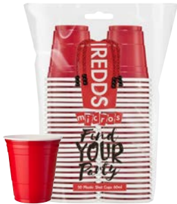
MICROS RED SHOT CUPS

PARTY & EARTH FRIENDLY , REDDS COLLECTION OF REUSABLE AND DISPOSABLE CUPS IS PERFECT FOR ANY EVENT. THE REUSABLE RANGE IS DISHWASHER SAFE FOR REPEATED USE , AND THE ORIGINAL CUPS ARE 100% RECYCLABLE AND BPA FREE FOR A MORE SUSTAINABLE FUTURE .