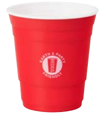
MINIS RED CUPS

Item Code RC-RE60RD10-6-4 Capacity 60ml Qty 6/Pack | 60/Inner | 240/Ctn Material Double Wall Polypropylene