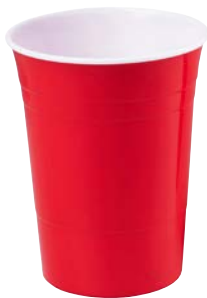
BIG RED CUPS

Item Code RC-RE285RD3 Capacity 285ml Qty 3/Pack | 36/Ctn Material Double Wall Polypropylene