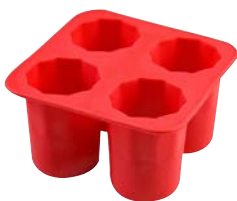
SILICON SHOT CUPS MOULD

Item Code RC-RE360CR3-12 Capacity 360ml Qty 3/Pack | 36/Ctn Material Double Wall Polypropylene