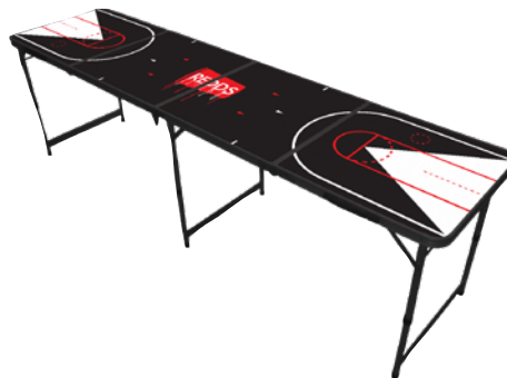
BEER PONG TABLE

Item Code RC-SL1RD1-8 Capacity 4 x 30ml Qty 1/Pack | 8/Ctn Material Red Silicone