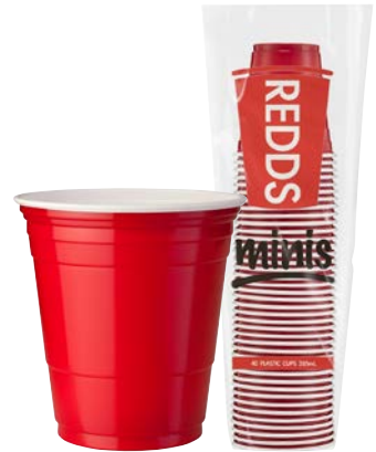
MINIS RED CUPS