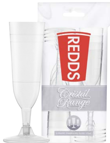
CRISTAL RANGE CHAMPAGNE FLUTE

RC-W175CR8-15 175ml 8/Pack | 120/Ctn Polystyrene