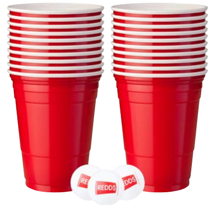
CUP PONG PACK

RC-CP425RD20 425ml 20/Pack | 240/Ctn 20 x Red 425ml Cups & 3 x Ping Pong Balls