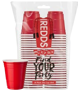
MICROS RED SHOT CUPS