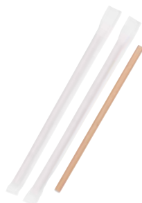
REGULAR STRAW WRAPPED

Item Code STHSC8L Length 200mm Diameter 8mm Qty 1,800/Ctn