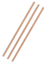
REGULAR STRAW UNWRAPPED

MADE USING SUGARCANE FIBRE, STROH'S SUGARCANE RANGE IS AN ECO-FRIENDLY PLASTIC-FREE ALTERNATIVE. 100% COMMERCIALY COMPOSTABLE CERTIFIED , THESE PLANT-BASED DRINKING STRAWS BREAK DOWN IN 160 DAYS AND WILL GROW BACK OVER TIME .