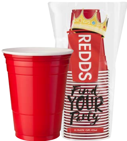
BIG RED CUPS