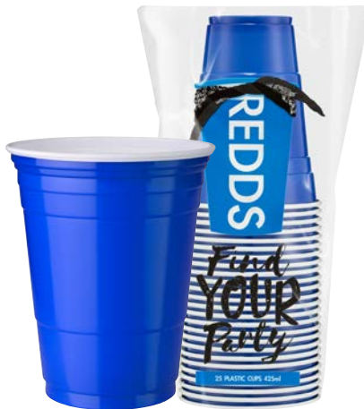
BIG BLUE CUPS