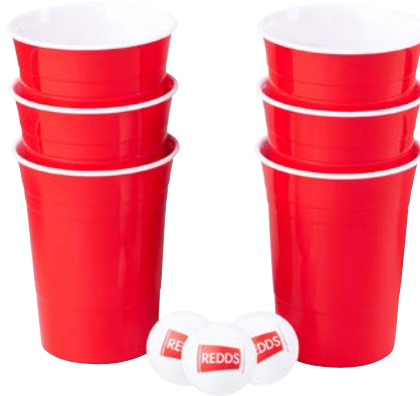
CUP PONG PACK

Item Code RC-RE425RD3-12 Capacity 425ml Qty 3/Pack | 36/Ctn Material Double Wall Polypropylene