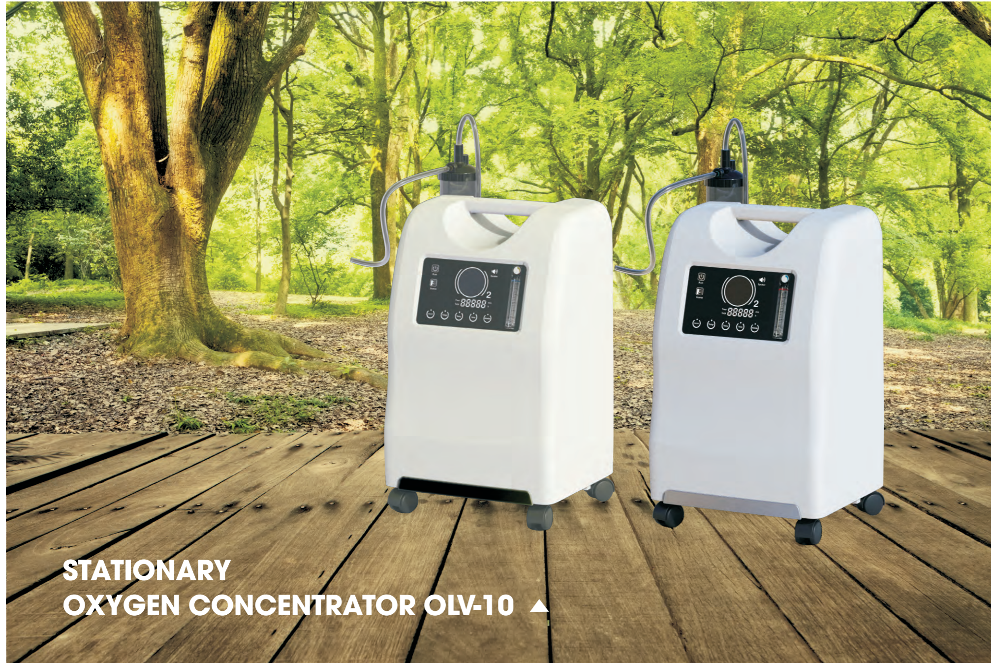
STATIONARY OXYGEN CONCENTRATOR OLV-10 ▲