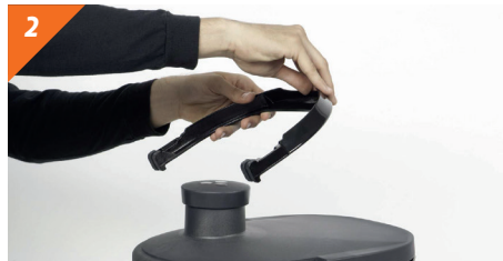
2 Remove security handle by positioning horizontally and pulling handle in the opposite direction.