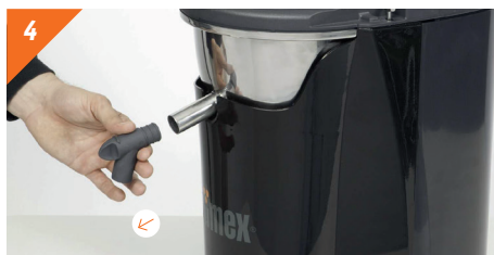
4 Remove tap by pulling out.