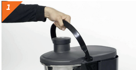
1 Raise security handle.

Zumex recommends cleaning the machine at least once or twice a day , depending on how much it is used in order to maintain optimal food hygiene conditions.