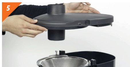
5 Remove top Multifruit lid by lifting upwards.