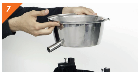
7 Disassemble grating filter and juice tank by pulling upwards.