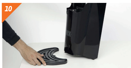
10 Pull out coaster tray.