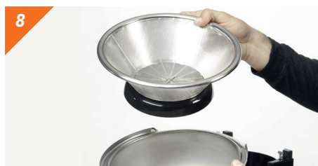
8 Separate filter from filter cover. ATTENTION! Do not touch the sharp points of the grater as they could cut you.