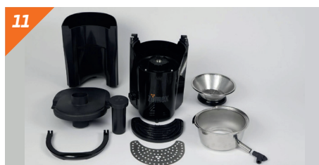
11 Clean parts.