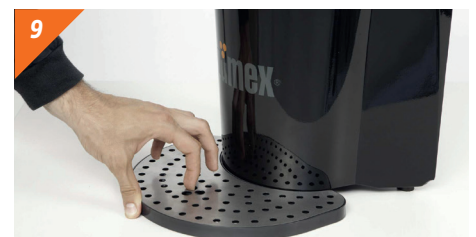
9 Remove coaster from coaster tray by inserting your index finger and pulling out gently.