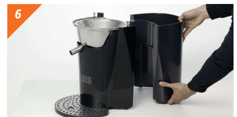
6 Remove waste container by pulling up horizontally.