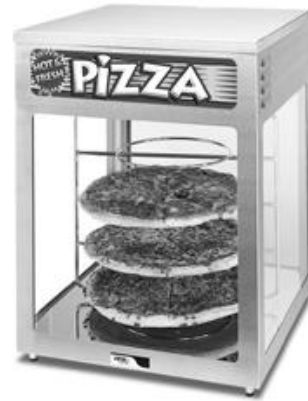
Model: HDC-4 Heated Display Cabinet