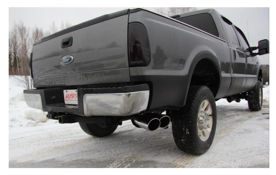
Congratulations! You are ready to begin experiencing the improved power, sound and driving experience of your MBRP Inc. performance exhaust system. We hope you enjoy your purchase.