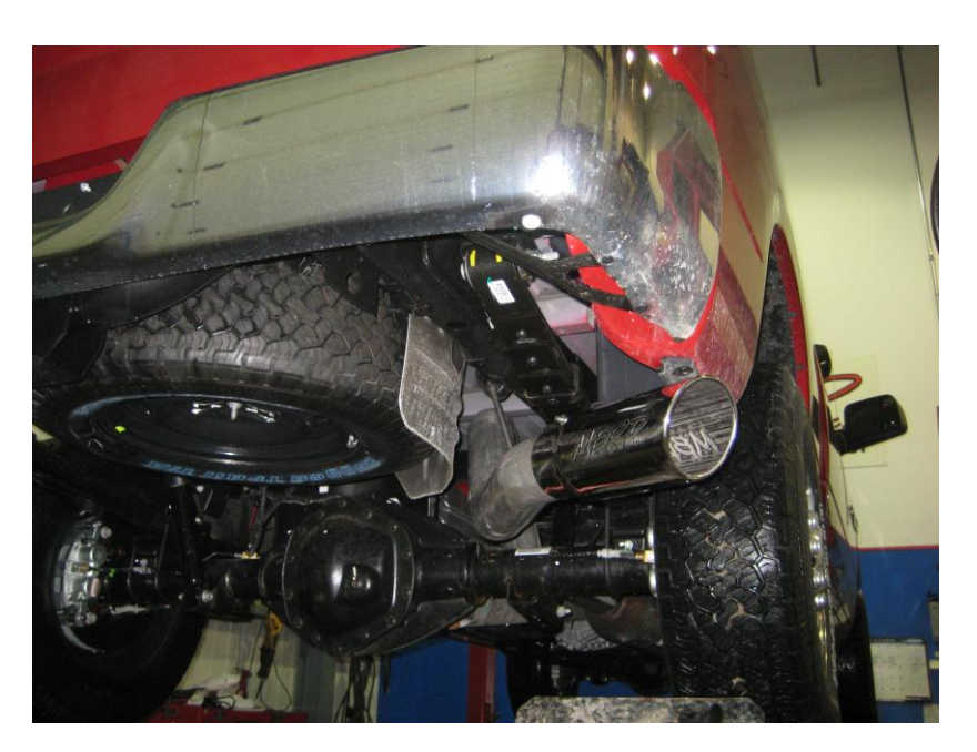
Congratulations! You are ready to begin experiencing the improved power, sound and driving experience of your MBRP Inc. performance exhaust system. We know you will enjoy your purchase.