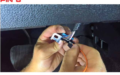
STEP 5 RE-INSTALL THE BLUE PINLOCK AND RE-ATTACH THE OBD2 PLUG

STEP 4 INSERT THE OBD2 SIDE WIRE INTO PIN 8