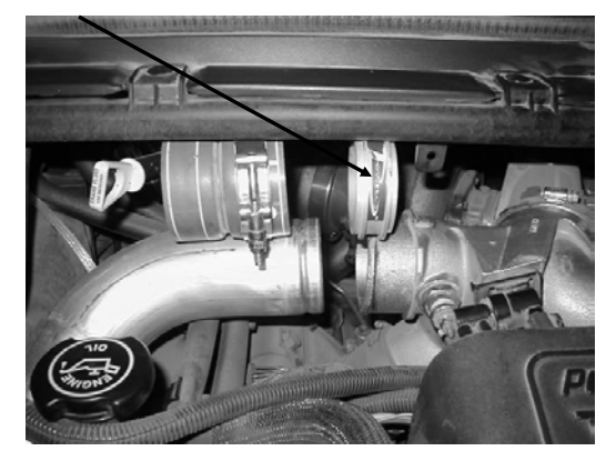
Ref. A– Power Plate