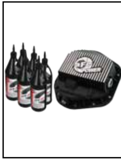
Front Differential Cover

P/N: 46-70082-WL (w/ Oil) 46-70082 (Blk) 46-70080 (RAW)