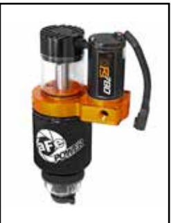
Diesel Fuel System

P/N: 42-13031 (Full-time) 42-13032 (Part-time)