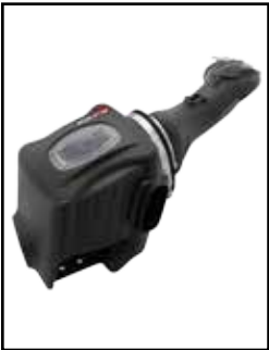
Air Intake System

P/N: 46-70022-WL (w/ Oil) 46-70022 (Blk) 46-70020 (RAW)