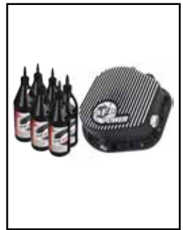
Rear Differential Cover

P/N: 46-70022-WL (w/ Oil) 46-70022 (Blk) 46-70020 (RAW)