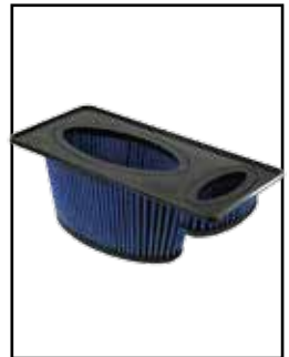
OER Air Filter

P/N: 10-10107 (P5R) 11-10107 (PDS) 71-10107 (PG7)