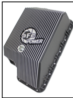
Transmission Pan Cover

P/N: 46-70082-WL (w/ Oil) 46-70082 (Blk) 46-70080 (RAW)