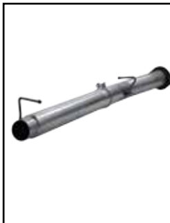
Exhaust Race Pipe