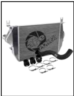
Intercooler w/ Tubes