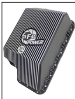
Transmission Pan Cover

P/N: 46-70082-WL (w/ Oil) 46-70082 (BIK) 46-70080 (RAW)