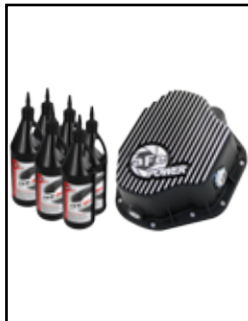
Rear Differential Cover

P/N: 46-70032-WL (w/ Oil) 46-70032 (Blk) 46-70030 (RAW)