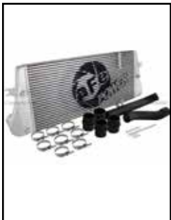
Intercooler w/ Tubes