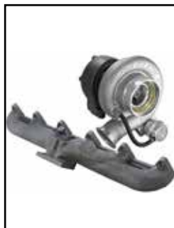
Turbocharger w/ Manifold

P/N: 46-70032-WL (w/ Oil) 46-70032 (Blk) 46-70030 (RAW)