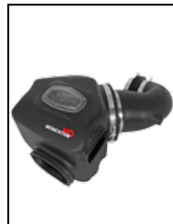
Air Intake System