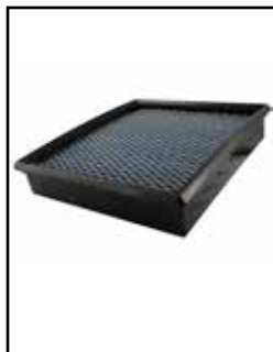
OER Air Filter

P/N: 30-10011 (P5R) 31-10011 (PDS) 73-10011 (PG7)