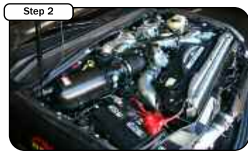
Complete stock intake.