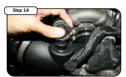
Re-install crank case line into new tube. Push down completely. Re-connect MAF sensor and filter minder.