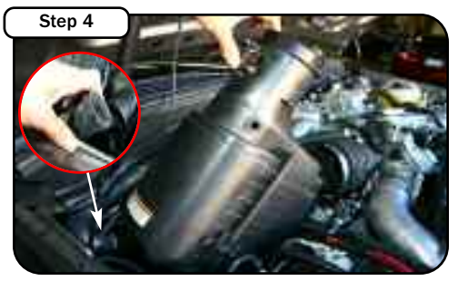
Take auxillary air line out of air box. Lift and pull firmly then remove OE air box out of vehicle.