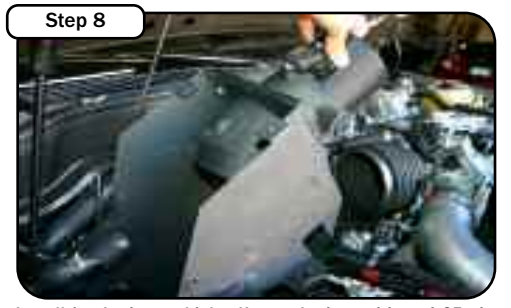
Install intake into vehicle. Keep tabs in position of OE air box bracket.