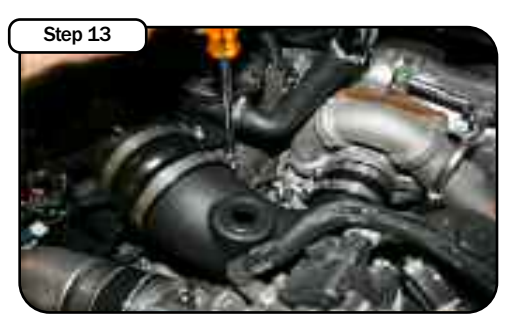
Install new tube with couplers and clamps provided. Tighten using 5/16" nut driver. Install grommet into tube.