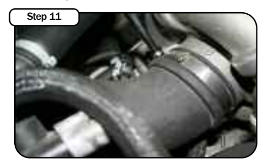
With 5/16" nut driver loosen both clamps on turbo and air box side.