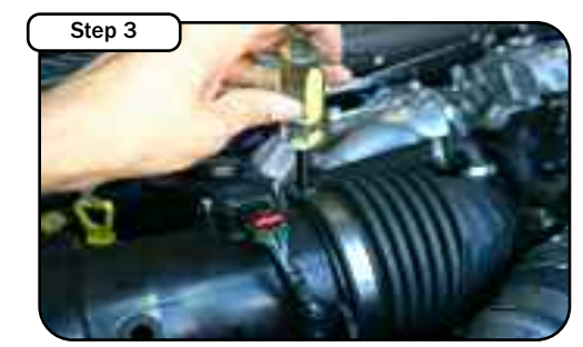
Remove filter minder out of air box. Loosen factory clamp with 5/16" nut driver. Disconnect MAF sensor harness.