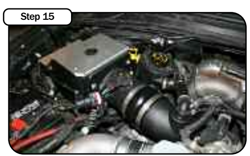
Your installation is now complete. Make sure all hoses and clamps are tight. Check and retighten connections and filter after a few hours of operation. Thank You for choosing aFe! NOTE: Place enclosed CARB EO sticker on or near the air intake on a smooth/clean surface. EO identification label is required to pass the smog test inspection.