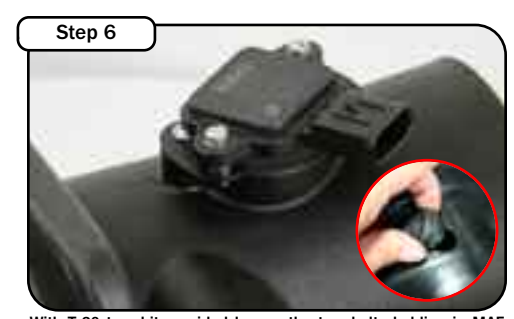
With T-20 torx bit provided loosen the two bolts holding in MAF sensor and remove. Remove grommet for filter minder. With screws and gasket provided, install MAF sensor into new intake tube. (make sure gasket is between sensor and tube) Re-install filter minder grommet into intake tube.