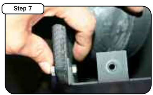
Install tube outside of housing using M6 screws, nuts and washers provided and tighten.