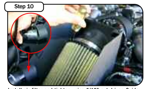
Install air filter and tighten using 5/16" nut driver. Guide auxillary air line into the housing clip. Install aluminum cover. Use 4 button head screws and tighten using 5/32" allen key.