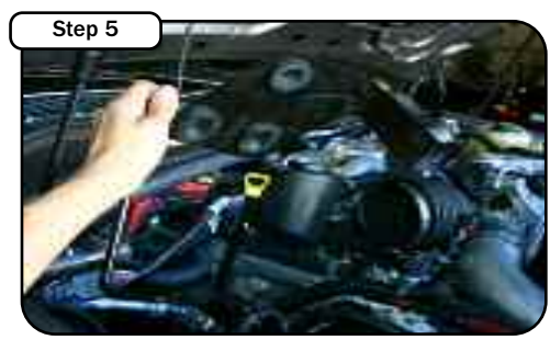
With 13 mm socket with extension, loosen the 2 bolts that hold the OE air box bracket and remove out of vehicle.