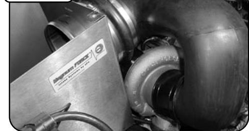
Slip boots over intake tube and install on turbo and filter housing. It may be easier to install clamps after tube is in position. If filter restriction gauge is desired, drill an 11/16 hole with a woodworking spade bit and transfer grommet and sensor to new intake tube. Sensor should be placed near larger end of tube for accurate results.