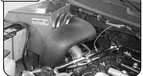
Make sure all clamps are tight and that all electrical components are secure. Check and retighten connections and filter after a few hours of operation.

Place the included CARB EO Sticker on or near the intake system on a smooth, clean surface. E.O. identification label is required in passing the Smog Check Inspection.