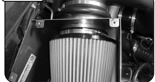
Install factory pre-oiled filter into housing. Install cover and make a final check for loose clamps, pinched wires etc. before starting engine.