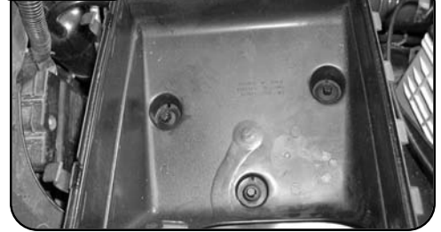
Remove lower half of filter box, unscrew 3 inserts and transfer inserts to new filter housing.