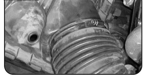
Loosen clamp at turbo inlet and remove top half of filter box and filter element.