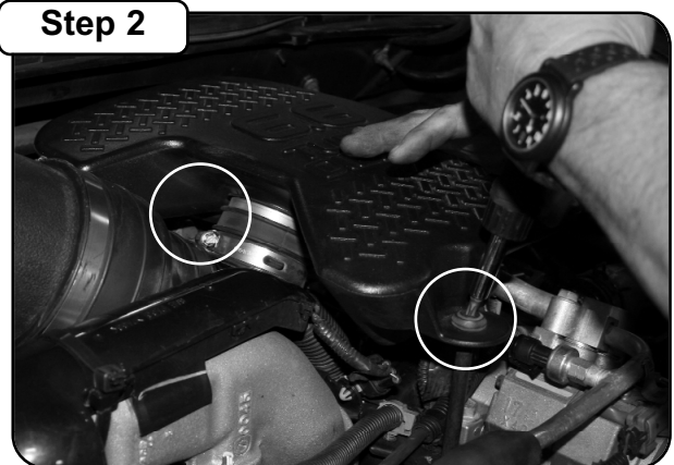
Remove resonator plenum: remove mounting screw with T30 Torx driver. Loosen clamp with flathead screw driver or 1/4" socket driver.