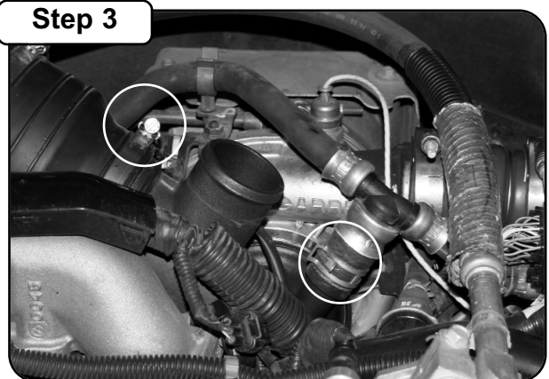
Open clamp on CCV hose coupler with pliers and remove coupler from the stock turbo inlet tube. Loosen air intake coupler clamp at stock turbo inlet tube with flathead screw driver or 5/16" socket driver.