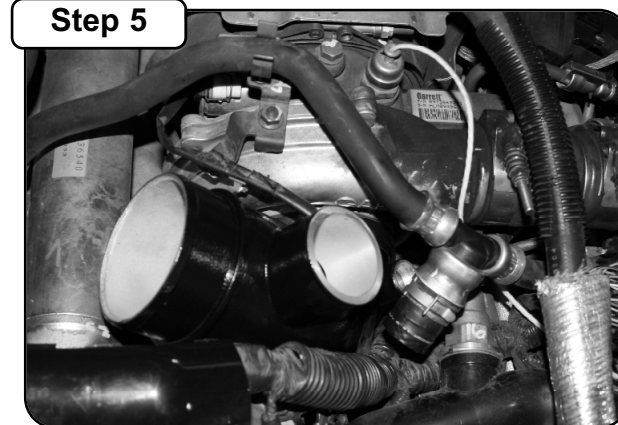
Install aFe turbo inlet tube. Ensure flange clamp fit correctly on turbo inlet tube and turbo. Do not tighten clamp.