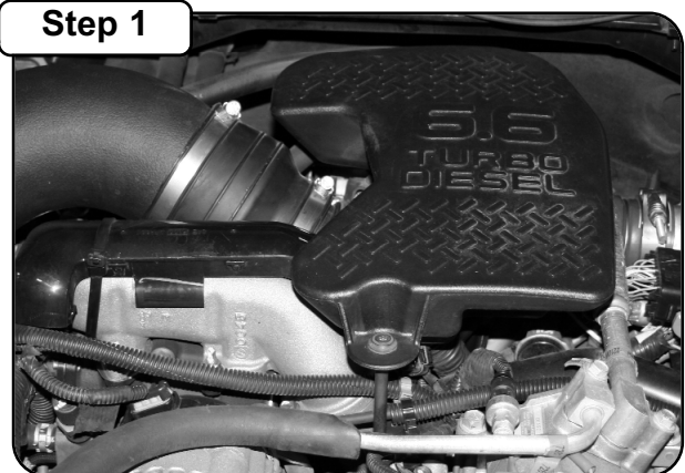
Stock turbo inlet tube.

advanced FLOW engineering™ P.O. Box 1719 Corona, CA 92878 Support: 951-493-7100 aFepower.com