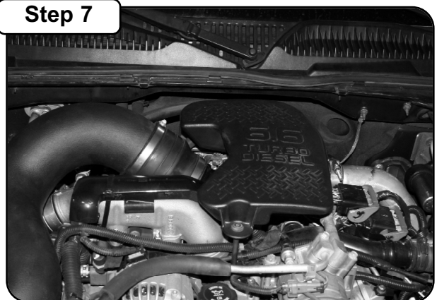
Re-attach resonator plenum on aFe turbo inlet tube. Tighten clamp with flathead screw driver or 1/4" socket driver. Re-install mounting screw with T30 Torx driver. Your installation is now complete. Thank you for choosing aFepower!

Place the included CARB EO sticker on or near the Turbo Inlet Tube on a smooth, clean surface. EO identification label is required to pass the Smog Check Inspection.