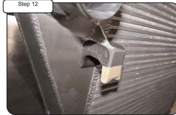
Remove the 2 U-shaped rubber isolators from stock intercooler and install to new BladeRunner® intercooler. NOTE: Tape isolators in place for easier installation.