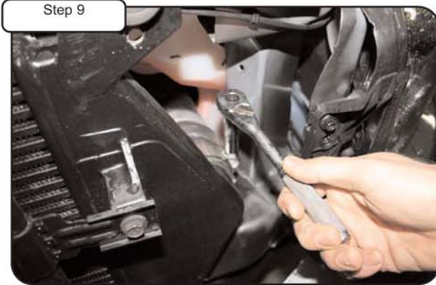
Loosen clamps on intercooler tubes using 7/16" deep socket.