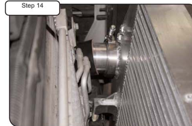
Position and make sure intercooler rubber U-shaped isolators sit square on cross beam and have not folded during installation.