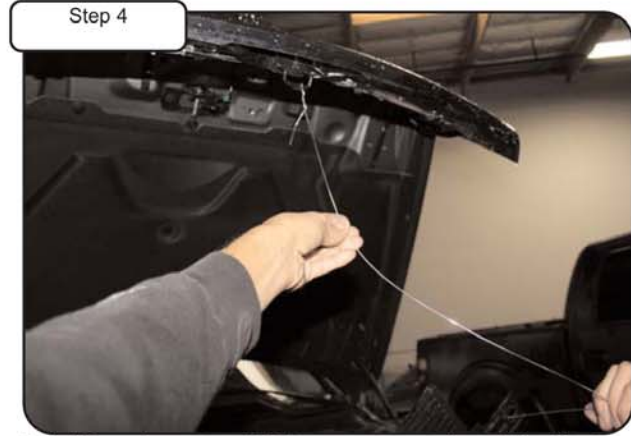
Step 4 With A/C condensor turned 90 degrees, secure to the vehicles lifted hood using steel wire.