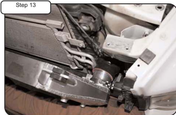
Now install BladeRunner® intercooler into vehicle.