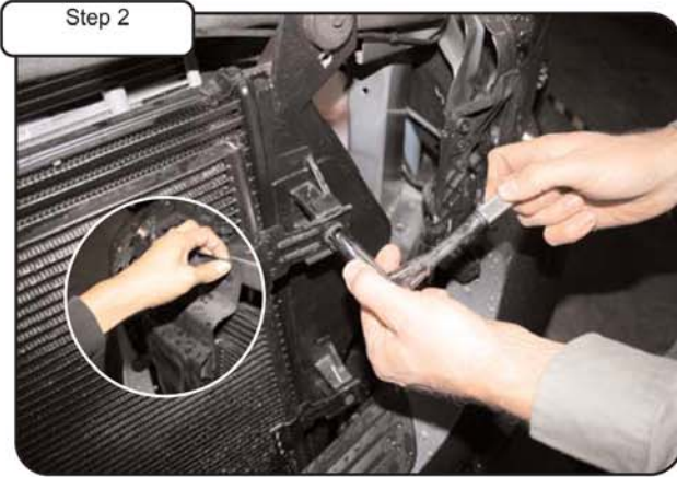
Step 2 Remove plastic A/C line protector on passenger side. With 13mm socket or wrench. Now loosen the 4 bolts holding in A/C condensor.