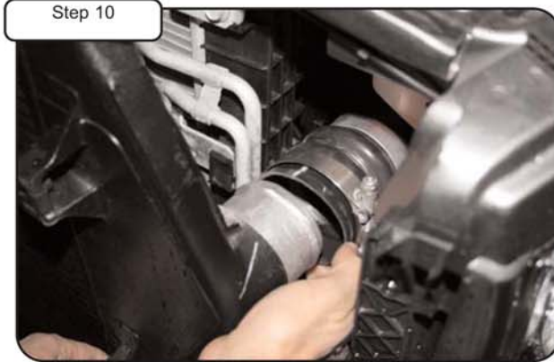
Pull back coupler from intercooler. Now remove stock intercooler out of vehicle.