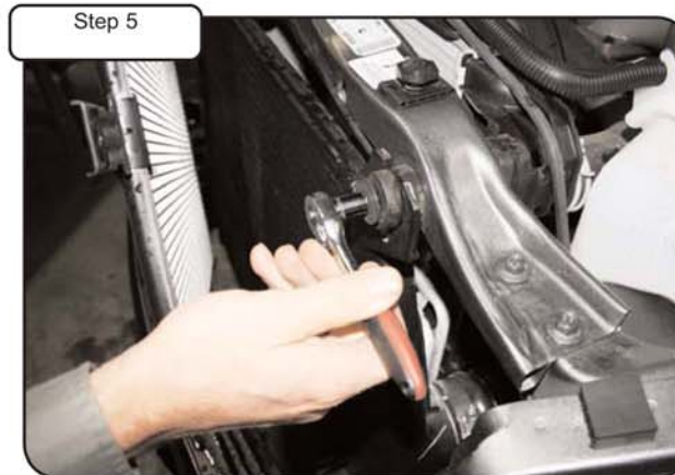
Step 5 With 10mm socket or wrench remove the 2 top intercooler attachment bolts connected to upper radiator support.