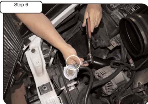
Step 6 With 10mm socket and extension loosen the two bolts holding in radiator on back of upper radiator support.