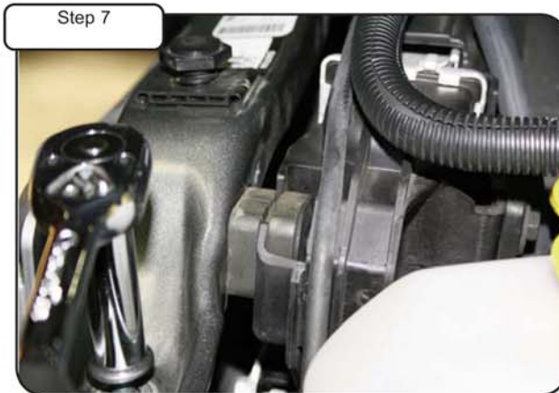
Step 7 Loosen and remove the 4 bolts holding in upper radiator support using 13mm socket or wrench.