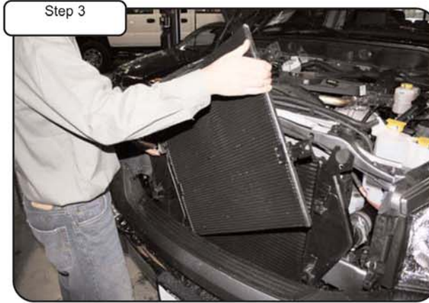
Step 3 Rotate the A/C condensor up and out away from vehicle. Take care to prevent damage to A/C lines.