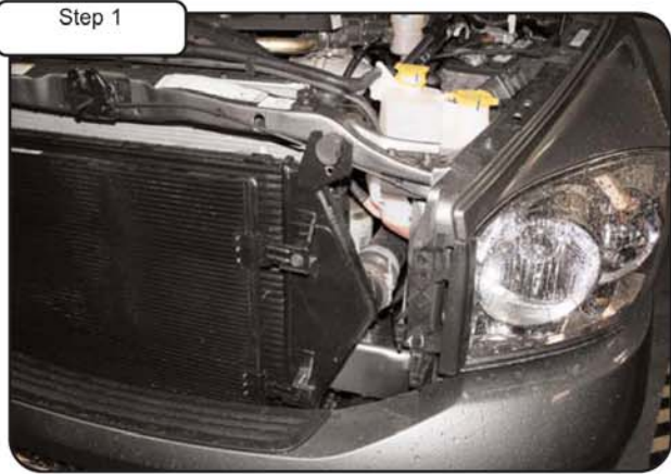
Step 1 Stock Intercooler. NOTE: Disconnect battery before install. Remove stock air box or intake system from vehicle for easier installation.