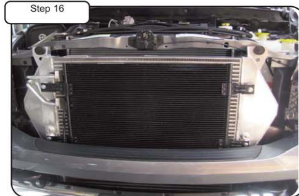
Re-attach A/C condenser with supplied screws and lock washers. Re-install intake/ stock air box & re-connect battery. Your installation is now complete. Please check all screws and clamps periodically. Re-tighten if necessary. Thank you for choosing aFePower!

California vehicle code sections 27156 and 38391 prohibit the advertising, offering for sale, or installation of any device, which modifies a vehicle's emission control system unless exempted. Unless otherwise noted, aFePower have not received an exemption from these code sections and are not legal for sale or use in California on vehicles originally equipped with pollution-control devices. It is illegal, except for racing vehicles, which may never be driven upon a highway, to remove or otherwise render inoperative any emission control device on regulated motor vehicles. Check the aFe website to ensure proper application.