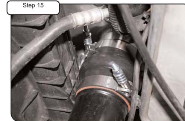
INTERCOOLER MAY NEED ALIGNMENT, TIGHTEN WHEN IN CORRECT POSITION & PROPER CLEARANCE. Re-install Radiator support (See reverse steps 5 through 8). Tighten and torque all clamps to 5 ft. lbs.