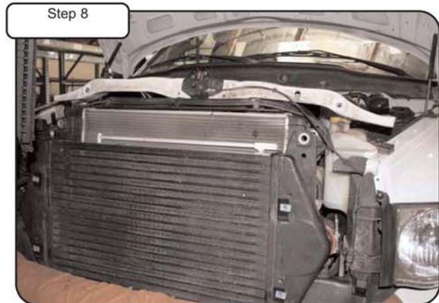
Step 8 Remove the upper radiator support and set aside on top of fan shroud.