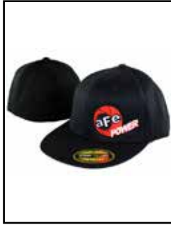
aFe Power Hat

P/N: 40-10114 (S/M) P/N: 40-10115 (L/XL)