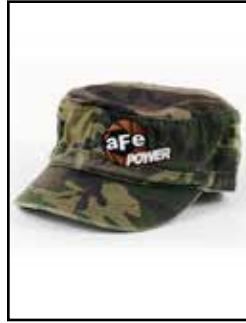
aFe Power Ladies Hat

P/N: 40-10114 (S/M) P/N: 40-10115 (L/XL)