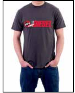
aFe Power Diesel T-Shirt

P/N: 40-30222-G (L) P/N: 40-30223-G (XL) P/N: 40-30223-G (2XL) P/N: 40-30223-G (3XL)