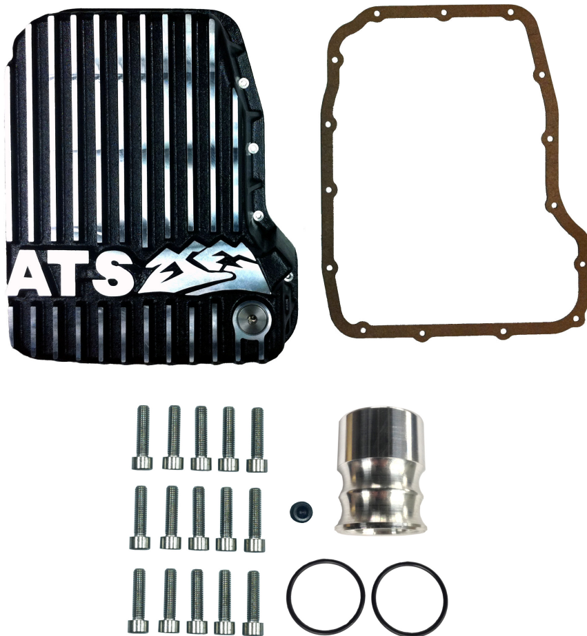
Figure 1 - 68-RFE Deep Pan Kit Contents

Please read all instructions before installation.