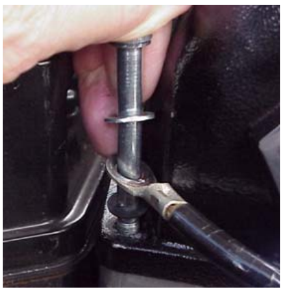
Figure 3 - Installing Ground Wire, Note Rubber Washer Below Ring Terminal