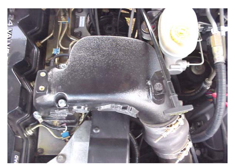
Figure 4 - Arc-Flow Intake Manifold After Installation

Note : Figure 4 shows a 24V Cummins, but 12V and Commonrail models look similar.