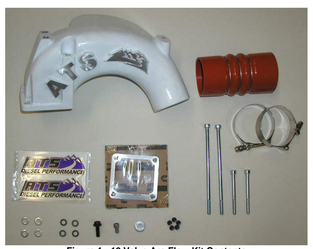
Figure 1 - 12 Valve Arc Flow Kit Contents

Thank you for purchasing the ATS Arc-flow Intake Manifold. This manual is to assist you with your installation. If installing for a customer, please pass this manual on to your customer for future reference.