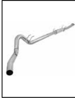
DP-Back Exhaust System

P/N: 49-43090-B (Blk Tip) 49-43090-P (Pol Tip)