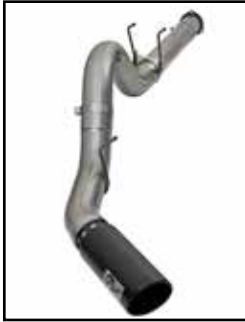
DPF-Back Exhaust System

P/N: 49-43090-B (Blk Tip) 49-43090-P (Pol Tip)