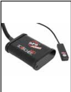
SCORCHER HD Module

P/N: 46-70022-WL (W/ Oil) 46-70022 (Black)