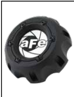
Engine Oil Cap