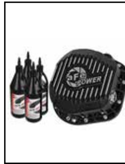
Intercooler Cold Side Tube

P/N: 46-70022-WL (w/ Oil) 46-70022 (Black) 46-70020 (RAW)