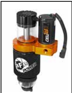
Diesel Fuel System

P/N: 42-13031 (Full-time) 42-13032 (Boost Activ.)