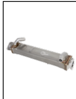
EGR Cooler Horizontal