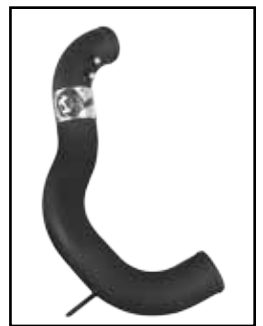
Intercooler Cold Side Tube

P/N: 46-70022-WL (w/ Oil) 46-70022 (Black) 46-70020 (RAW)