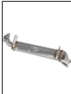
EGR Cooler Vertical

P/N: 42-13031 (Full-time) 42-13032 (Boost Activ.)