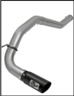
DPF-Back Exhaust System

P/N: 49-46113-B (Blk Tip) 49-46113-P (Pol Tip)