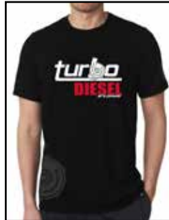
aFe Turbo Diesel T-Shirts

P/N: 40-30411-B (S) 40-30412-B (M) 40-30413-B (L) 40-30414-B (XL) 40-30415-B (2XL)