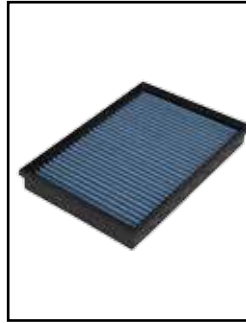
OE Replacement Filter

P/N: 30-10269 (P5R) 31-10269 (PDS) 73-10269 (PG7)