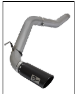
DPF-Back Exhaust System

P/N: 49-46112-B (Blk Tip) 49-46112-P (Pol Tip)