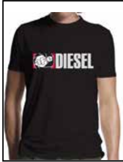
aFe Diesel T-Shirts

P/N: 40-30221 (M) 40-30222 (L) 40-30223 (XL) 40-30224 (2XL) 40-30225 (3XL)