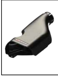
Air Intake Scoop