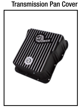
P/N: 46-70072 (Blk) 46-70070 (RAW)