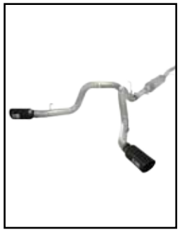
P/N: 49-04044-P (Pol) 49-04044-B (Blk) Exhaust Race Pipe