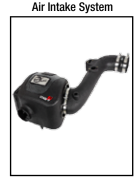
P/N: 51-82322 (PDS) 75-82322 (PG7)