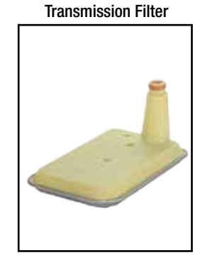
P/N: 44-TF006 (Deep Pan) 44-TF009 (Shallow Pan) OER Air Filter