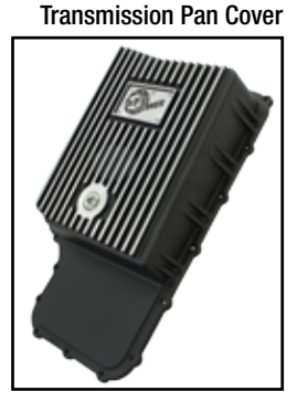
P/N: 46-70182 (Blk) 46-70180 (RAW)