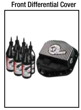
P/N: 46-70082-WL (w/ 0il) 46-70082 (Blk) 46-70080 (RAW)