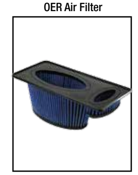
P/N: 30-80202 (P5R) 31-80202 (PDS) 73-80202 (PG7)