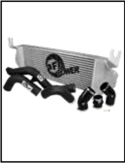
Intercooler w/ Tubes