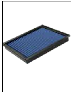
OER Air Filter