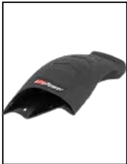
Air Intake System Scoop