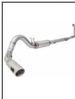
TB-Back Exhaust System

P/N: 49-43077-B (Blk. Tip) 49-43077-P (Pol. Tip)