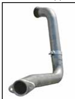
4" Turbo Downpipe