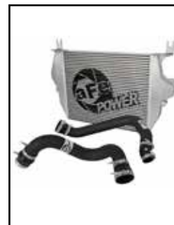
Intercooler w/ Tubes