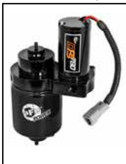
DFS780 PRO Fuel System