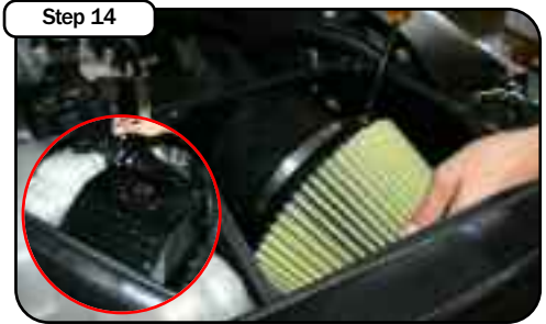
Install Air Filter and tighten using 5/16" nut driver. With button head screws provided, install housing cover and tighten using 5/32" allen key.