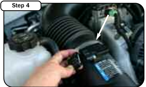
Disconnect MAF sensor harness .