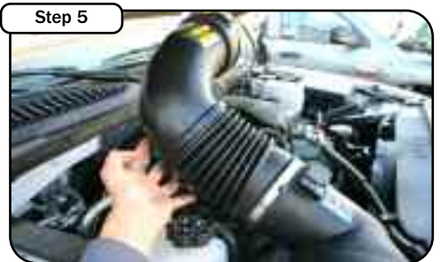
Carefully grab and pull out OE intake system. Remove out of vehicle.