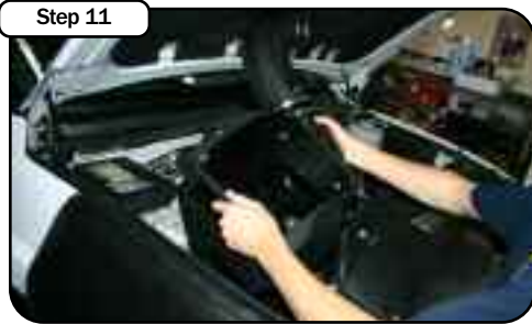
Install into vehicle. Position tube and housing to factory position. Do not tighten clamps!