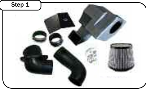
Complete kit components