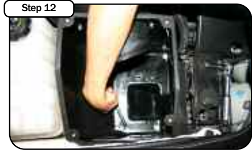
With 10mm socket or wrench, tighten down housing using 4 screws from step 6.