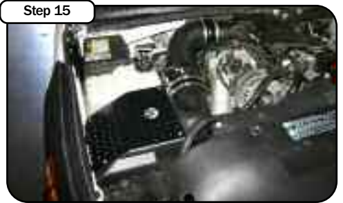
Your installation is now complete. Place enclosed CARB EO sticker on or near the intake on a smooth, clean surface. Check all clamps and connections. Periodically check all clamps and hoses. Thank you for choosing aFe!