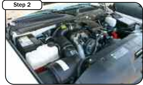
Complete stock intake.