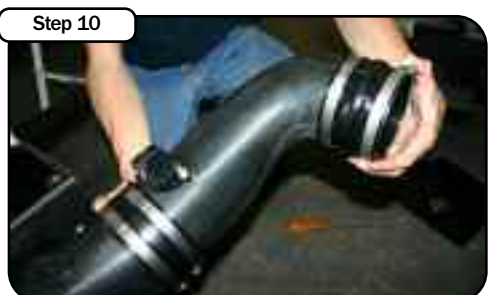
Install 5" straight coupler with clamps to MAF tube and connect to filter tube. Place hump coupler, at end of tube with clamps provided.