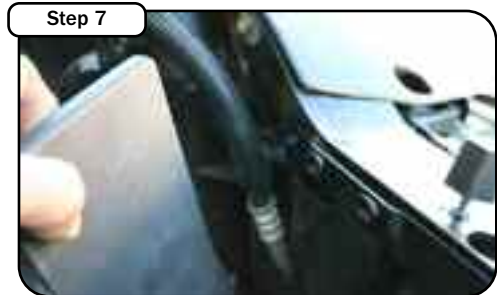
Remove plastic cover behind passenger head light.