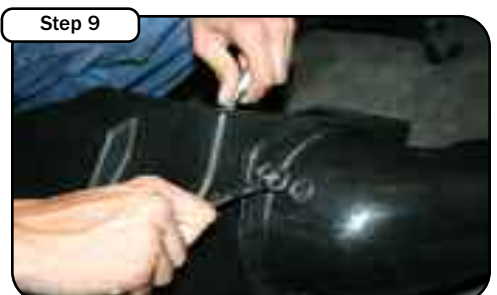
Install filter tube to outside of housing. Tighten using screws, washers and nuts provided with 7/16" socket or wrench.