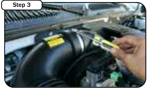
With 5/16" nut driver, loosen the clamp @ turbo end.