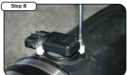
Remove MAF sensor from OE intake with T-20 torx bit. Insert MAF sensor into new tube with gasket, nylon spacer and #8-32 screws provided, spacers and gasket should be between tube and sensor.