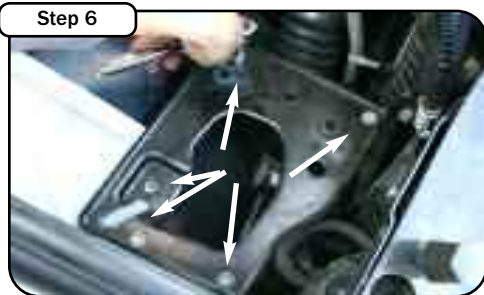
With 10mm socket, loosen the 5 screws holding the OE intake bracket and remove. Save 4 screws for later install.