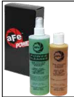
Gold Squeeze Restore Kit