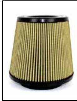
Pro-GUARD 7 Air Filter