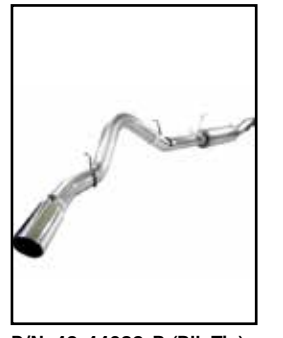
P/N: 49-44029-B (Blk Tip) 49-44029-P (Pol Tip)