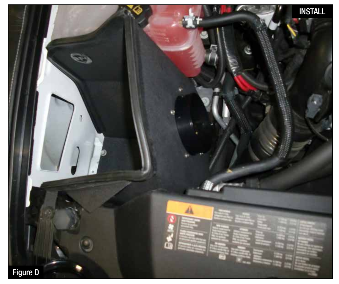
Refer to Figure D for step 8