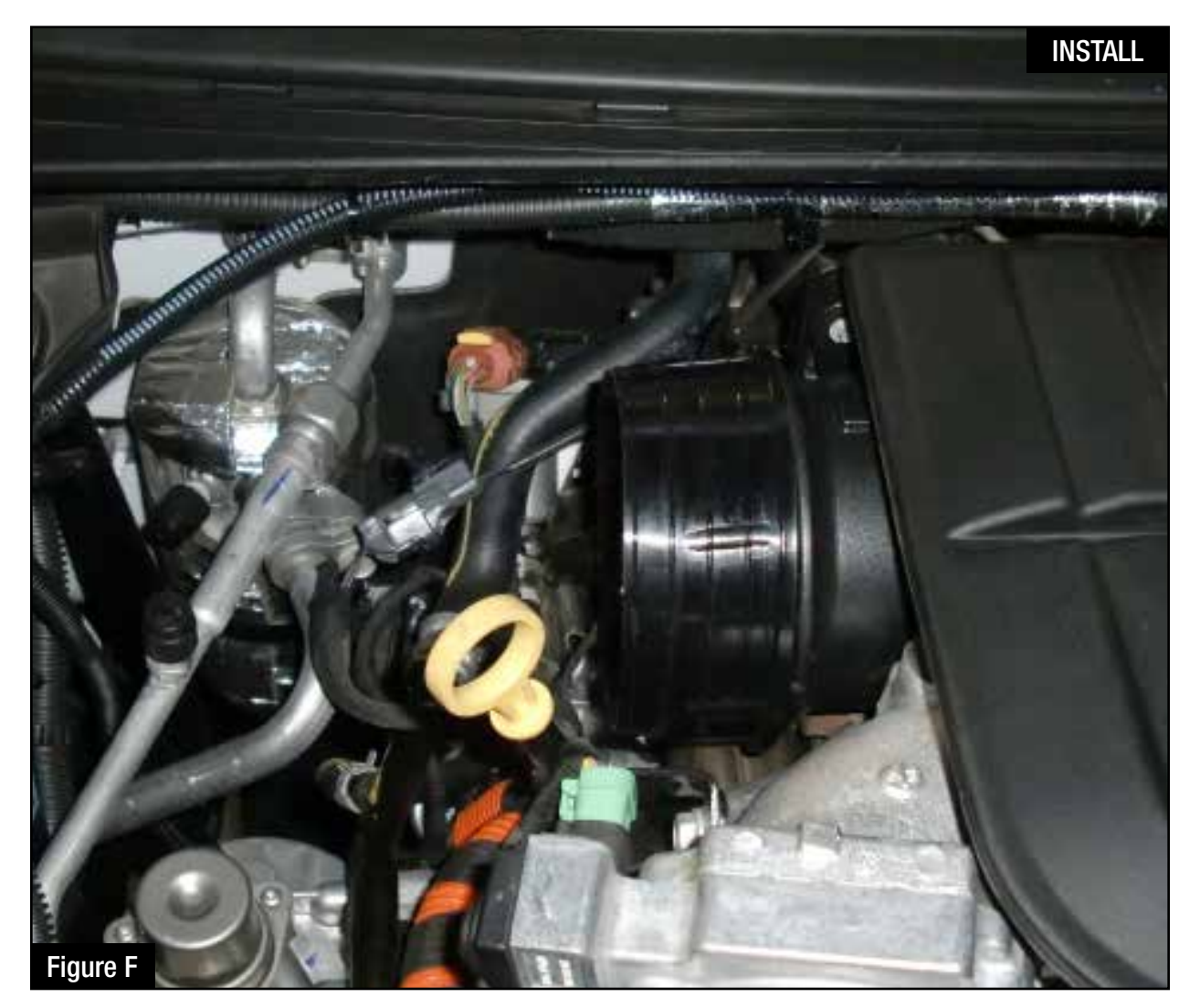
Refer to Figure F for step 10

Step 10: Wipe down inside and outside surfaces of the turbo inlet coupler to remove any slippery mold release agent. Install turbo inlet coupler over the turbo inlet.