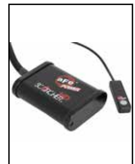
P/N: 77-44007 ('11-14') 77-44008 ('15-16')