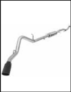
Down-Pipe Back Exhaust