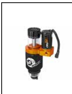
DFS780 Fuel Pump