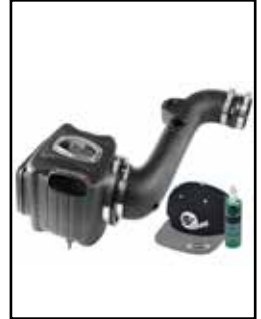
Diesel Elite Momentum HD Pro Dry S Cold Air Intake