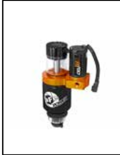
DFS780 Fuel Pump