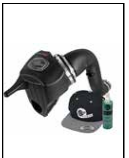
Diesel Elite Momentum HD Pro Dry S Cold Air Intake