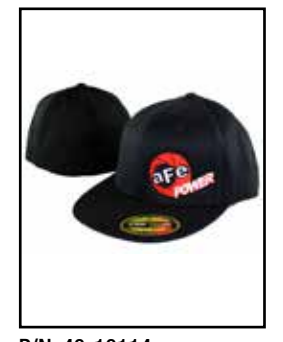
P/N: 40-10114 P/N: 40-10115