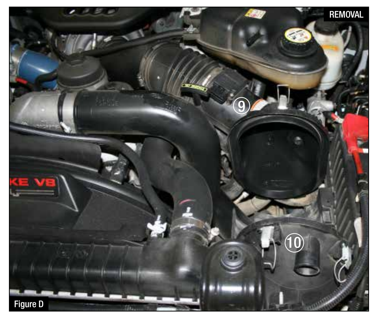
Refer to Figure D for step 10

Step 10: Remove items 9 & 10 to complete the removal of the stock intake system.