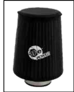
P/N: 28-10111 Yellow P/N: 28-10112 Red P/N: 28-10113 Black P/N: 28-10114 Blue