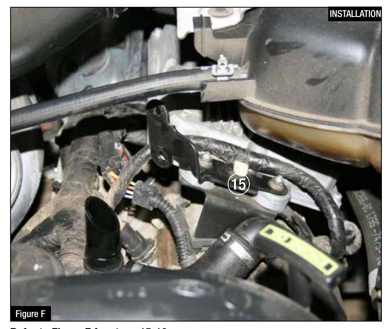
Refer to Figure F for steps 15-16

Step 15: Reinstall the bracket back in the factory location and secure with the factory nuts.