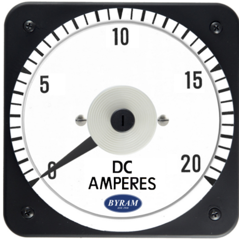
0-20 DC Amperes