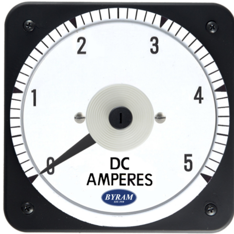
0-5 DC Amperes