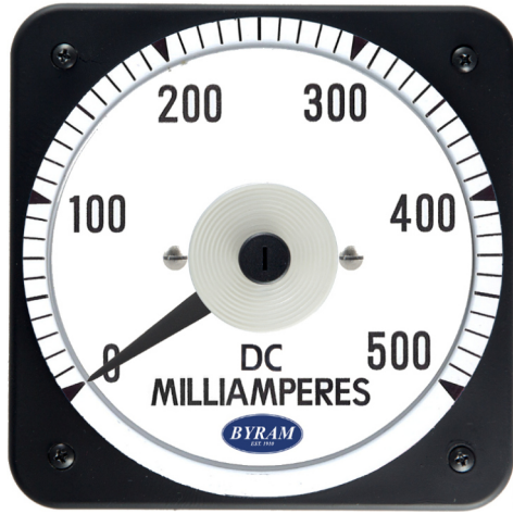
0-500 DC Milliamperes