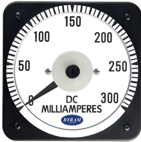
0-300 DC Milliamperes