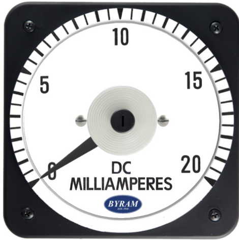
0-20 DC Milliamperes